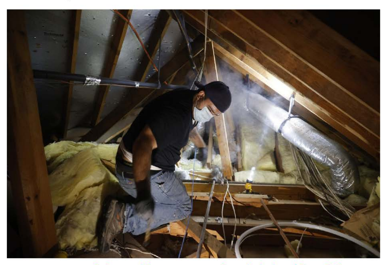
Environmental Entrepreneurs • www.e2.org • facebook.com/e2.org • @e2org

Mid-Atlantic * Midwest * New England * New York * Northern California * Pacific Northwest * Rocky Mountains * San Diego * Los Angeles